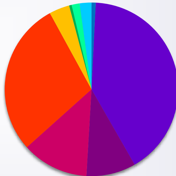
Foreign-Flagged Vessels (~18,000)

■ Barges ■ Bulk Carriers ■ Cargo Ships ■ Container Ships ■ Tankers ■ ROROs ■ Tugs/Tows ■ Passenger ■ Other